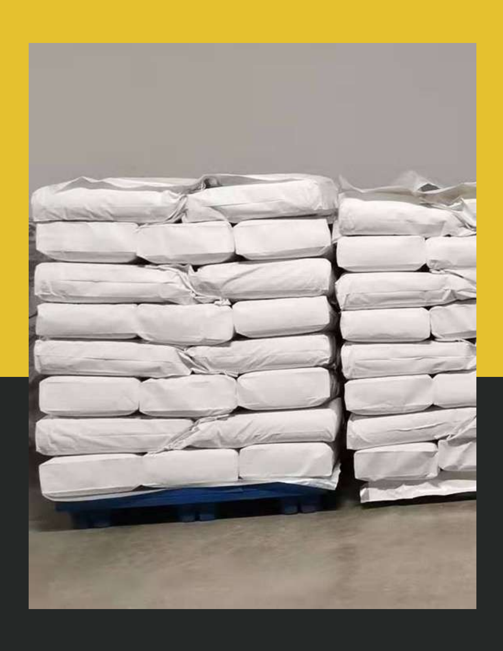
PAKCAGE 20kg per bag